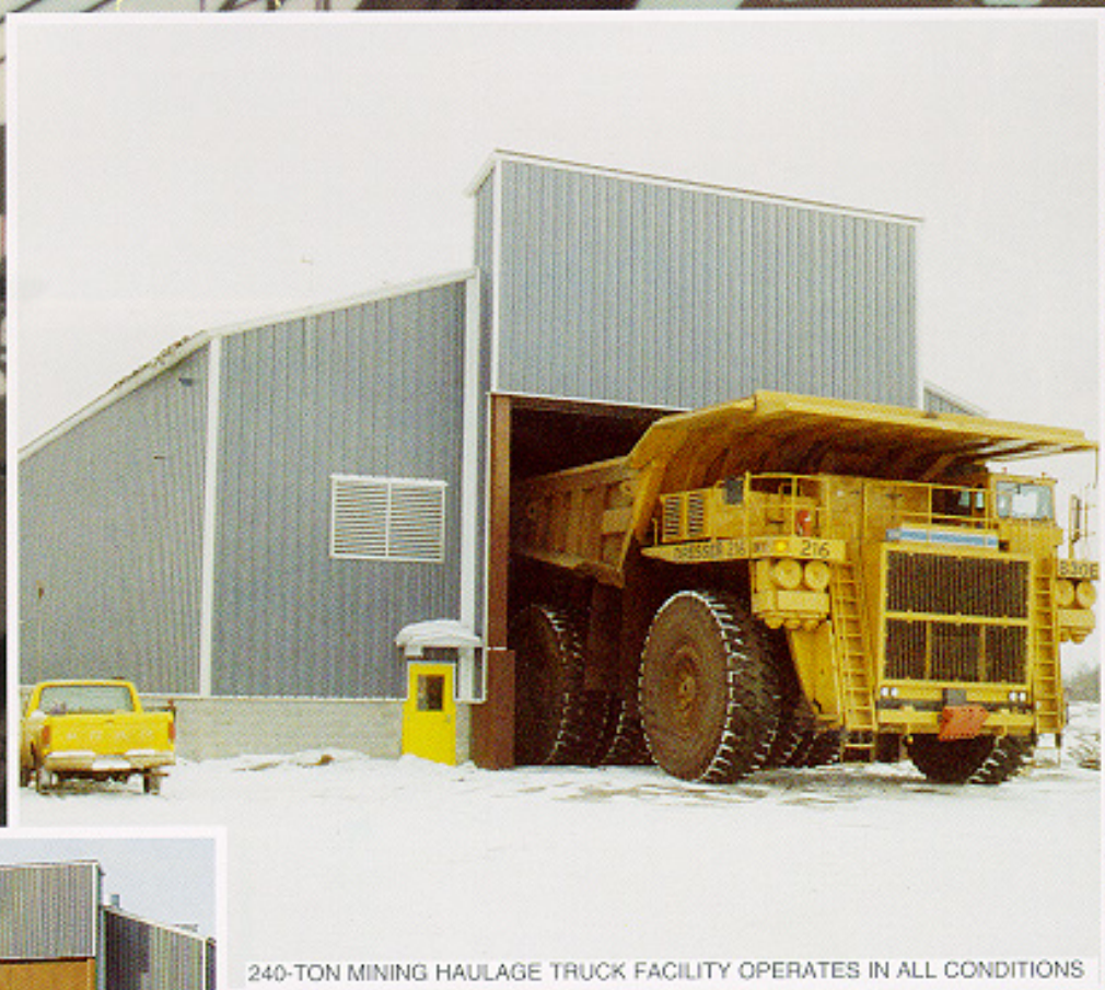
240-TON MINING HAULAGE TRUCK FACILITY OPERATES IN ALL CONDITIONS