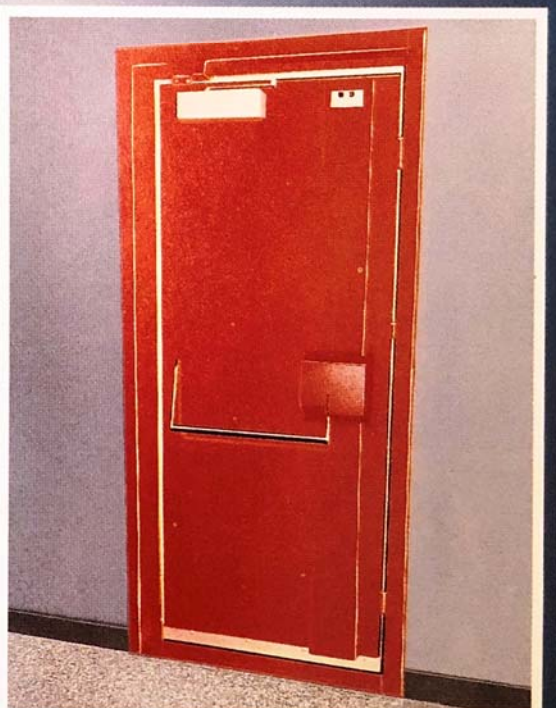
FIRE RATED BLAST RESISTANT DOOR